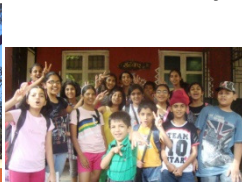
Fun Five days at the camp