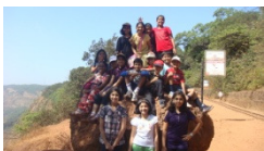
Smiles at Matheran