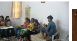
Playing YES 3 Solving Rubik 3