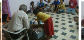
A magic show in progress