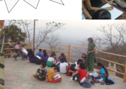
Live Painting Outdoor'n'Indoor