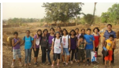
Visit to a brick factory