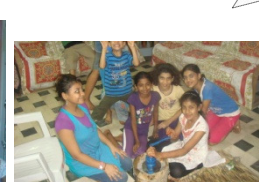
Children making Ice-Cream